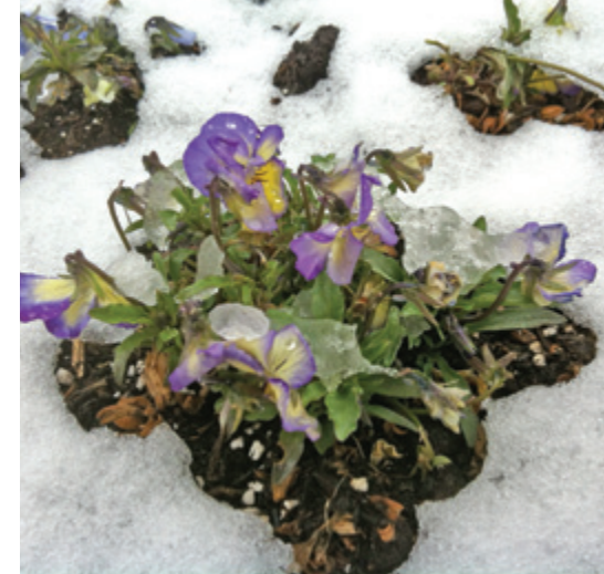
Violas in the snow.

At time of writing, about three quarters of the garden beds have been planted and many of them are showing new growth. We have four new Saskatoon bushes in the northwest corner of the perimeter bed and three new apple trees have been planted in the north perimeter bed. A special "thank you" to Larry Hart, Cheryl Moller and Linda Rands for their assistance and advice in selecting, transporting and planting the trees. We also thank the City of Calgary landfill for giving us free mulch